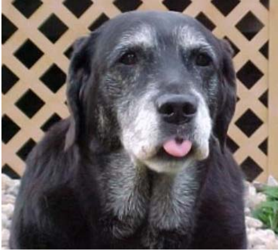
“Who are you calling old?” --- Boomer