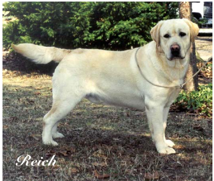
CH LUBBERLINE MARTINGALE---Pauline & Maurice Mortier---BEST OF BREED at MIAMI VALLEY LRC!