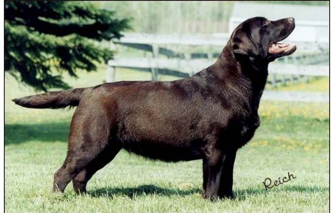
EPOCH'S BROWN BAGGIN'---Cindy Skiba WINNERS BITCH, BEST OF OPPOSITE SEX & BEST PUPPY!!!

3 RD EAST HILL MARSH MARIGOLD---Sheila Norgren