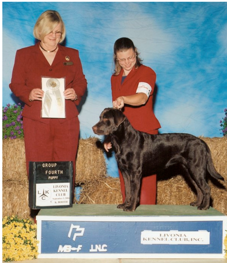
UCH Walkabout Endeavor Razzle Dazzle